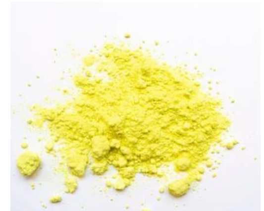
Pictured: Magical carbon catcher, COF-999.

change. It's like giving the planet a big helping hand!' The new material could play an important role in protecting the Earth and all the creatures that live on it. What a clever way to make the world a healthier place!