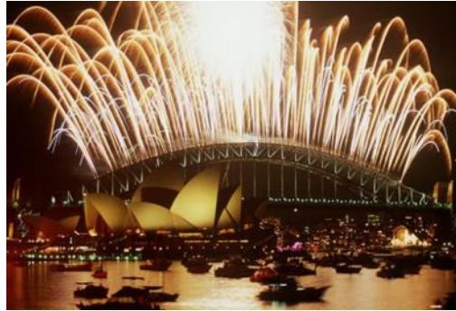
Pictured: Fireworks at Sydney Harbour Bridge, Australia.

'Fireworks bring people together in a magical way. It's wonderful to see everyone smiling and cheering!' Some places also have special traditions, like eating lucky foods or banging pots and pans. However you celebrate, New Year's Eve is a time for joy and new beginnings!