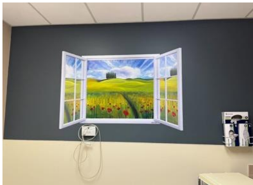
Pictured: LandEscape window murals painted in Roswell Park Comprehensive Cancer Center.